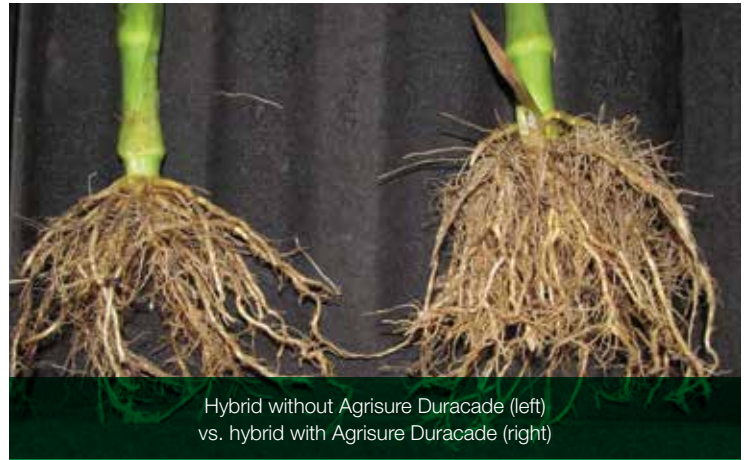
Hybrid without Agrisure Duracade (left) vs. hybrid with Agrisure Duracade (right)